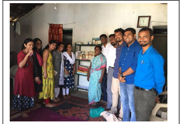
Field visit to SEARCH, Gadchiroli, Nagpur