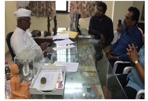
Field trip to Ralegoan Sidhi and discussion with renowned Gandhian and Social reformer Shri. Anna Hazare