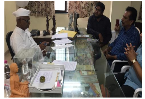
Field trip to Ralegoan Sidhi and discussion with renowned Gandhian and Social reformer Shri. Anna Hazare